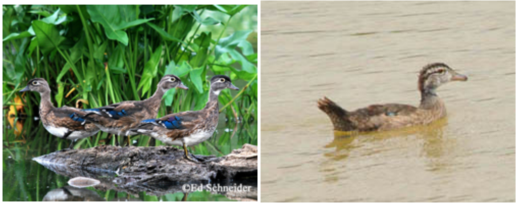
Immature Wood Ducks

In flight, both the male and female show a green patch (speculum) in the wing and a white belly.