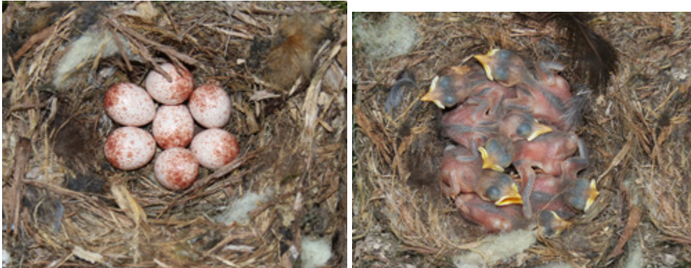
White-breasted Nuthatch eggs (left) and young (right).