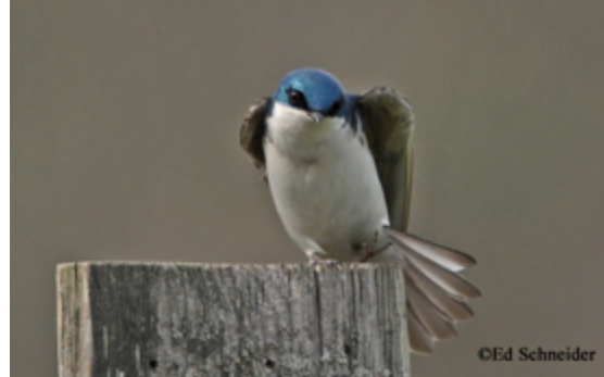
Male Tree Swallow